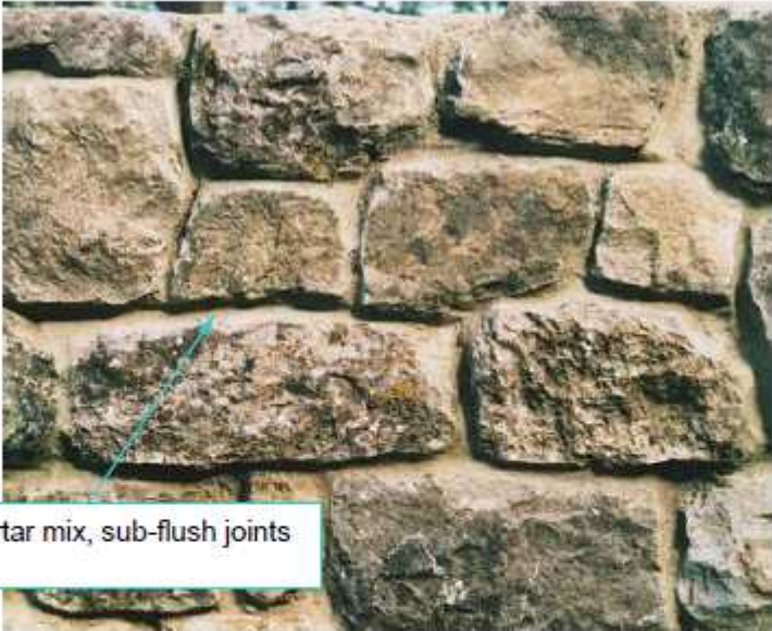
Example of repaired mortars