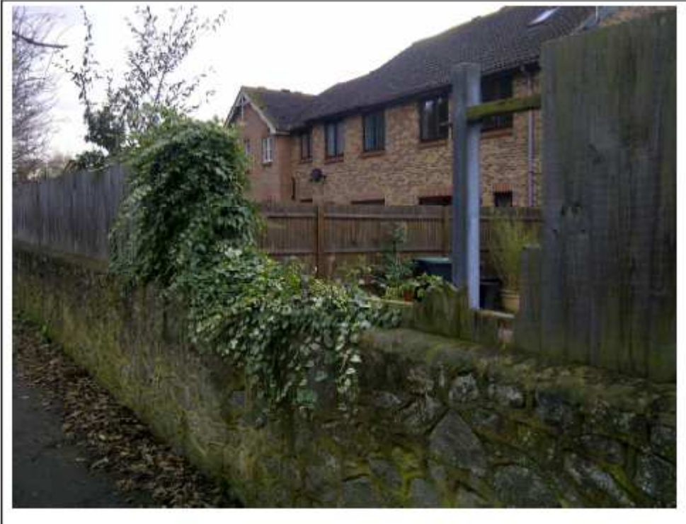
Example of unacceptable designed walling with timber top that is constantly being