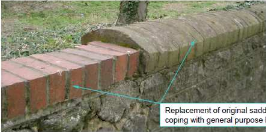
Examples of inappropriate repairs to copings