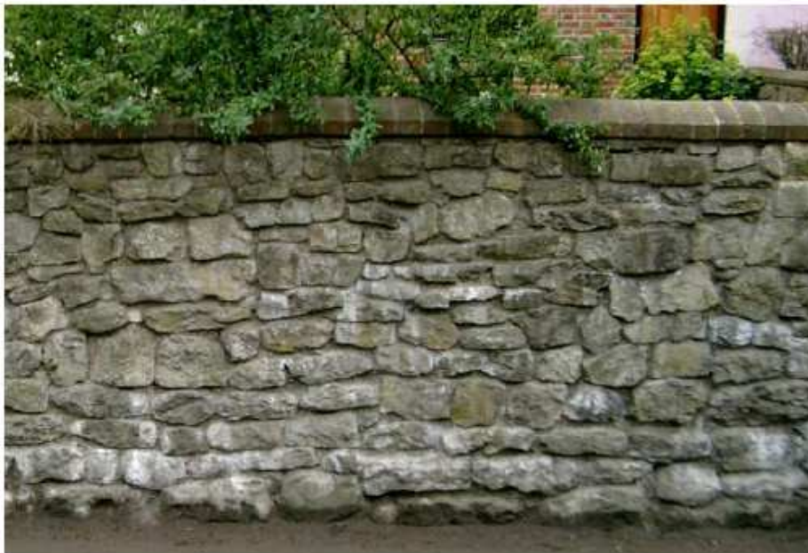
Example of random stone with red brick saddle coping

This is followed by some examples of new walls which have not incorporated these basic principles.