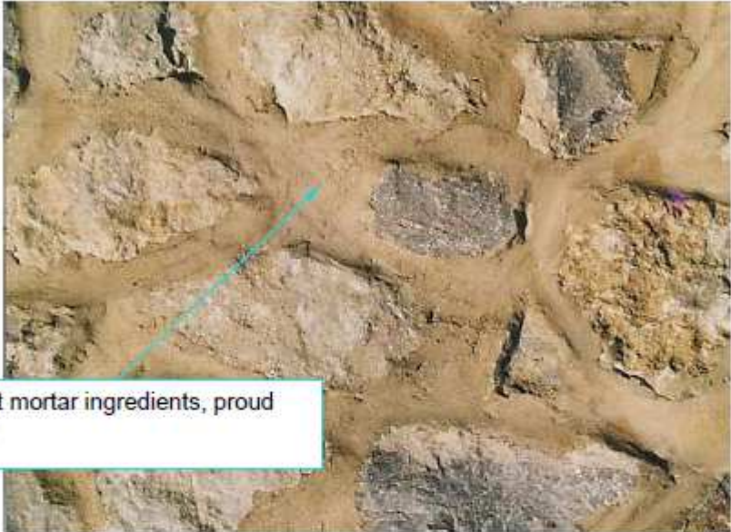
Incorrect mortar ingredients, proud mortars