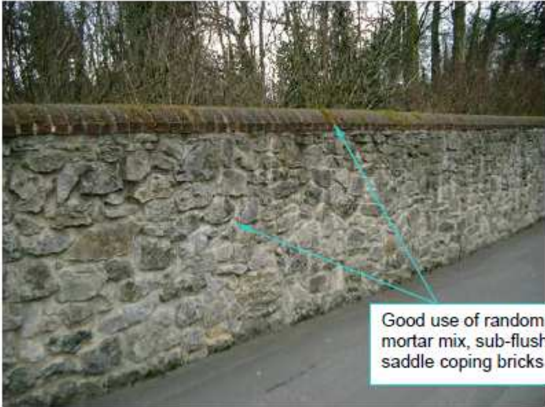
Example of rebuilt ragstone wall at Bradbourne Fields