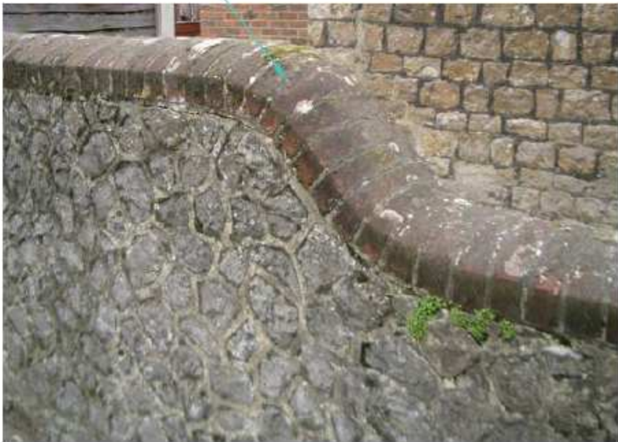
Example of how red saddle coping bricks are used when wall height changes

Saddle coping bricks shaped to achieve uniform joints