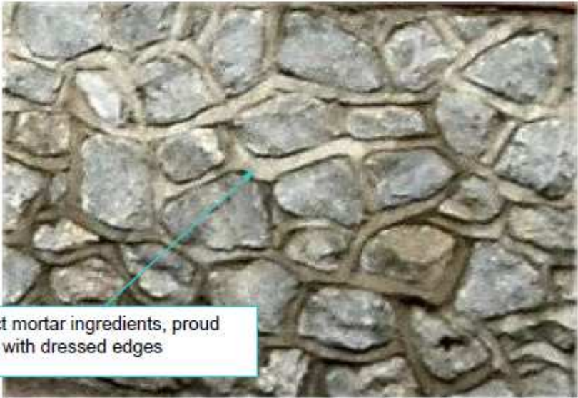
Incorrect mortar ingredients, proud mortars with dressed edges